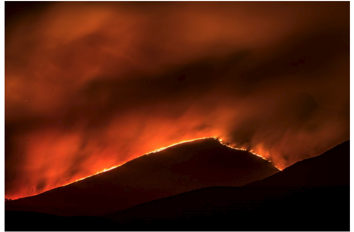
Fires on the distant ridge line