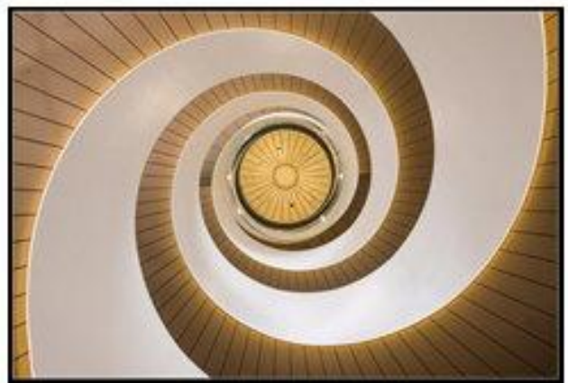
Ellen Ray 'Staircase UTS'