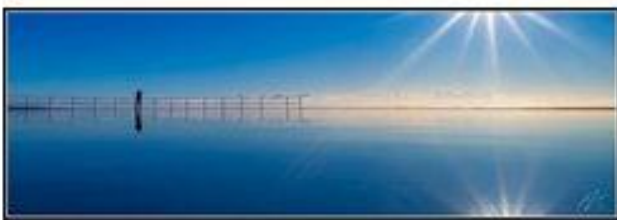
Greg Ford 'Wombarra Pool'