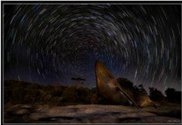
Paul Breadner 'Whales Star Trail'