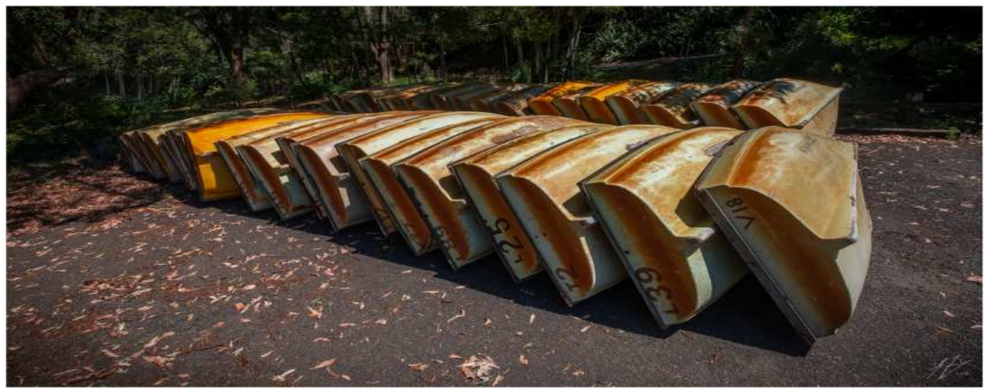
The boats currently stacked in the carpark waiting renovation scheduled to take 9 months ...