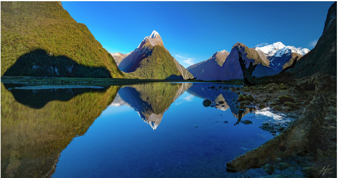
Milford Sound during the Photographic Society Trip Away in Oct, 2018