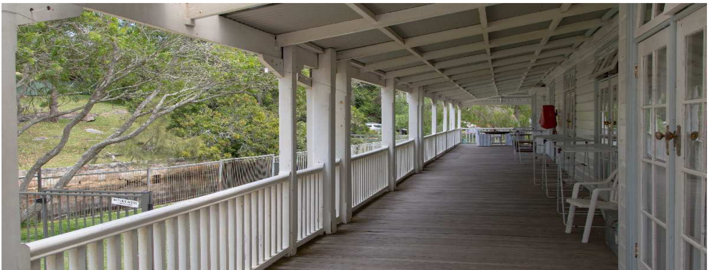
Protection if it's raining