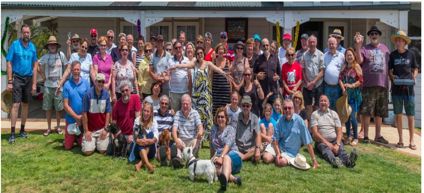
Last Year's Gathering