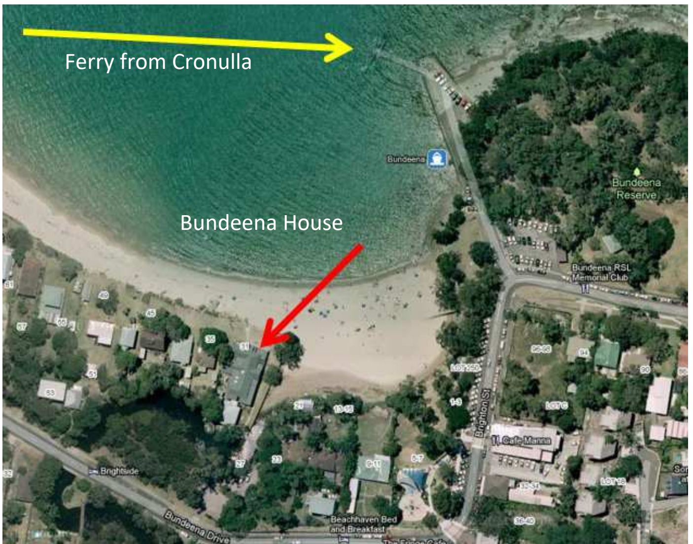
Easy walk round from the ferry (Cronulla Station to Bundeena)

Bring your meat and drinks. Plates, cutlery, bread rolls provided. Bring salad dishes to share and if some want to bring a sweets plate, it would be appreciated.