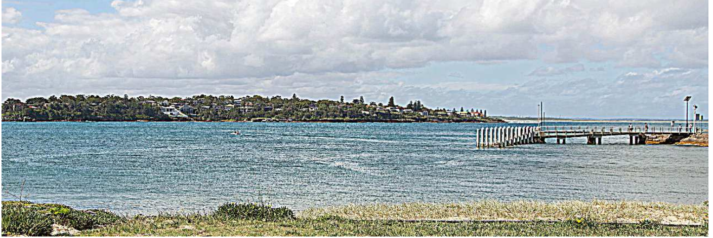
The view from the balcony

This is a great way to socialise with fellow Society members. This day gives visitors and New Members, the opportunity to get to know others in the Society in a relaxed, social environment – Please come along ... Bundeena House is a large, veranda surrounded historic building right on the beach at Bundeena (5 min walk from the Bundeena Ferry). In the last few years we have enjoyed this location for our Xmas BBQ, enjoying the opportunity to sit back and socialise with our friends in the Society. Quite a few people catch the ferry over from Cronulla.