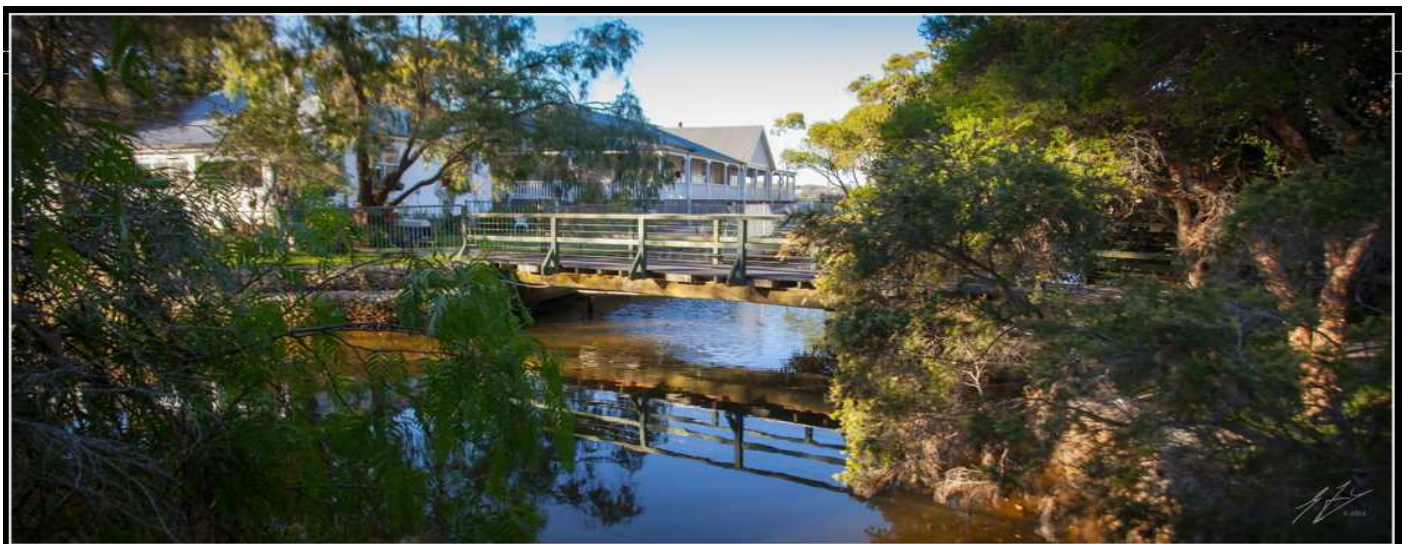
Access in from Bundeena Drive