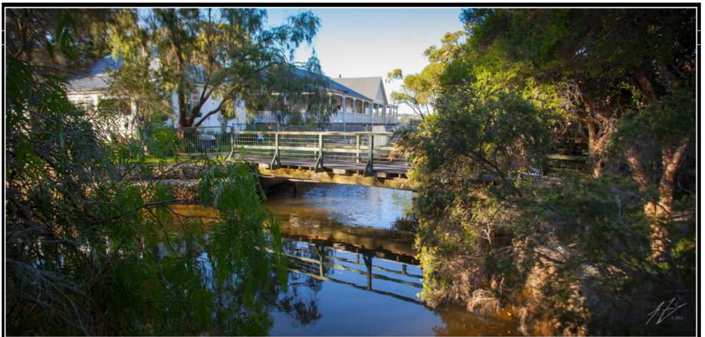
Access in from Bundeena Drive