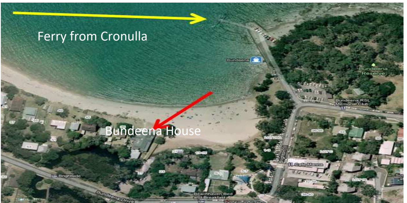
Easy walk round from the ferry (Cronulla Station to Bundeena)