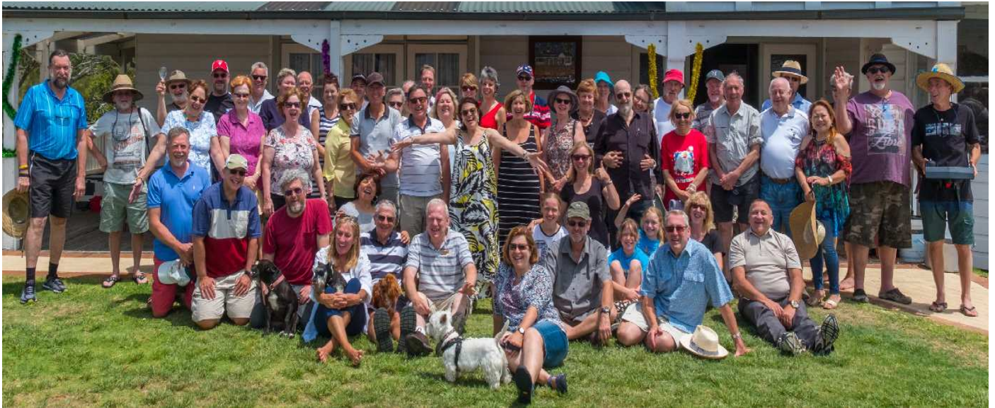
Last Year's Gathering