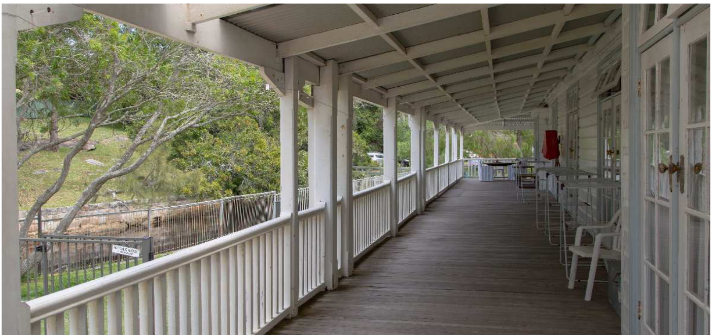
Protection if it's raining