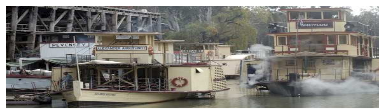
Murray River Scene, Echuca