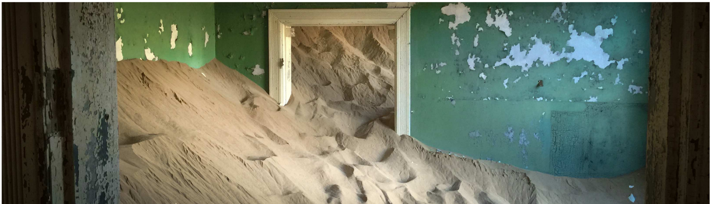
'Kolmanskop, Namibia - Africa' Trip #2 - Greg Ford (S.A.P.S.)