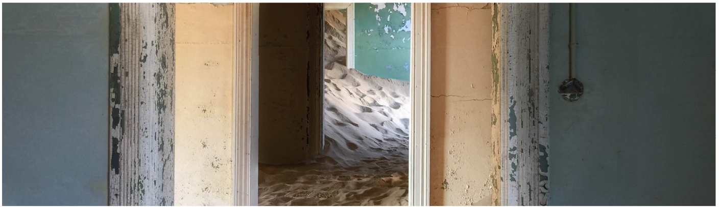
Kolmanskop, Namibia - Africa Trip #2 'Nature takes it Back' - Greg Ford (S.A.P.S.)