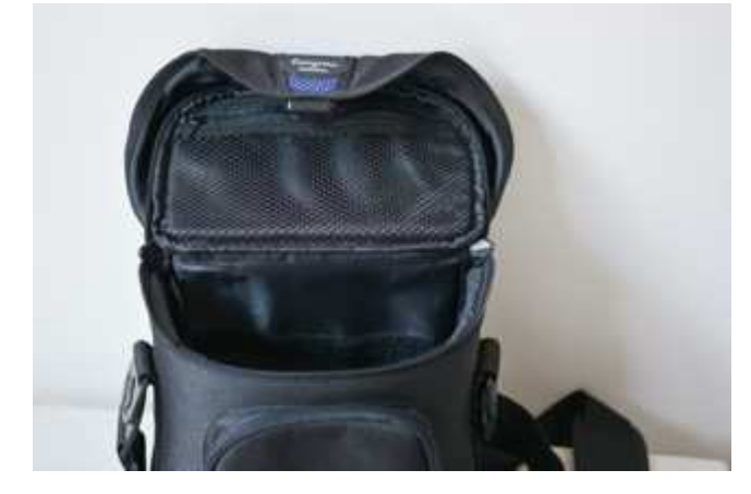
Yellow & Black – suits DSLR + 2-3 lenses. Strap converts to backpack straps. Padded with Velcro insert. -$10