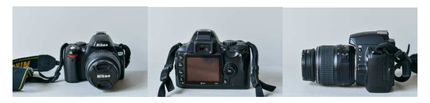
Nikkor 55-200 f 4-5.6 lens + lens hood & strap + box - $90