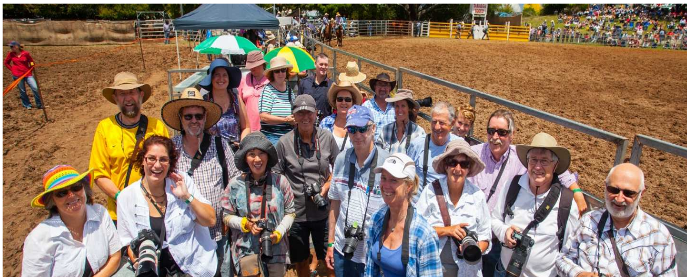
Some of the Taralga Rodeo Outing Members (25 th January, 2015)