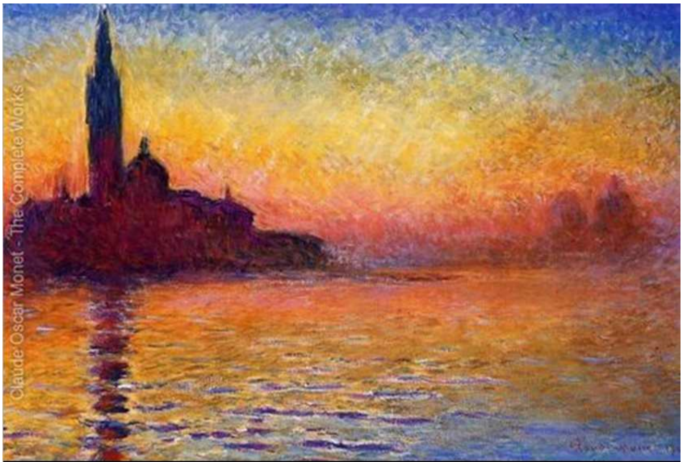
Claude Oscar Monet – Painter