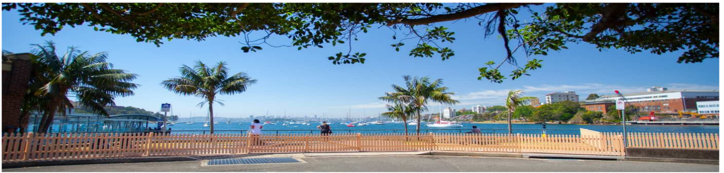
Taken at Ferry Hopping Outing - Sunday 23 rd October, 2014 (Neutral Bay)