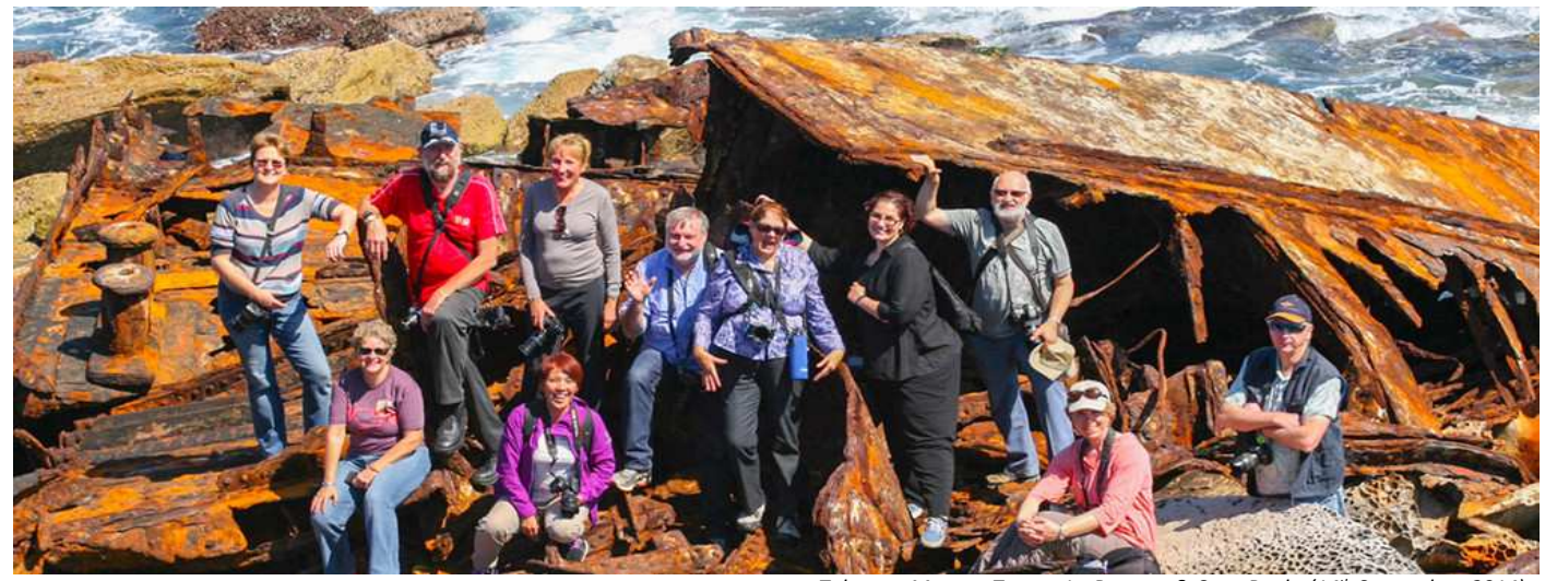
Taken on Mystery Tour to La Perouse & Cape Banks (14th September, 2014)