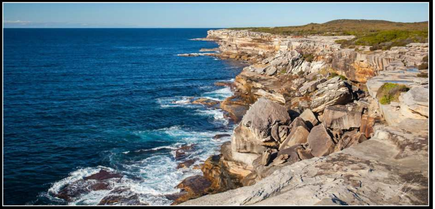
Taken on Society Outing to Cape Solander Sun 27 th July, 2014