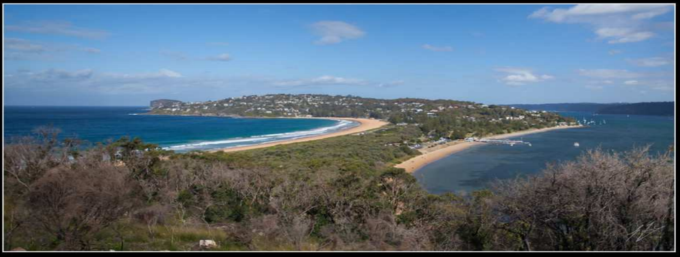
Taken on Day Mystery Tour to Barrenjoey Lighthouse on 13 th July, 2014