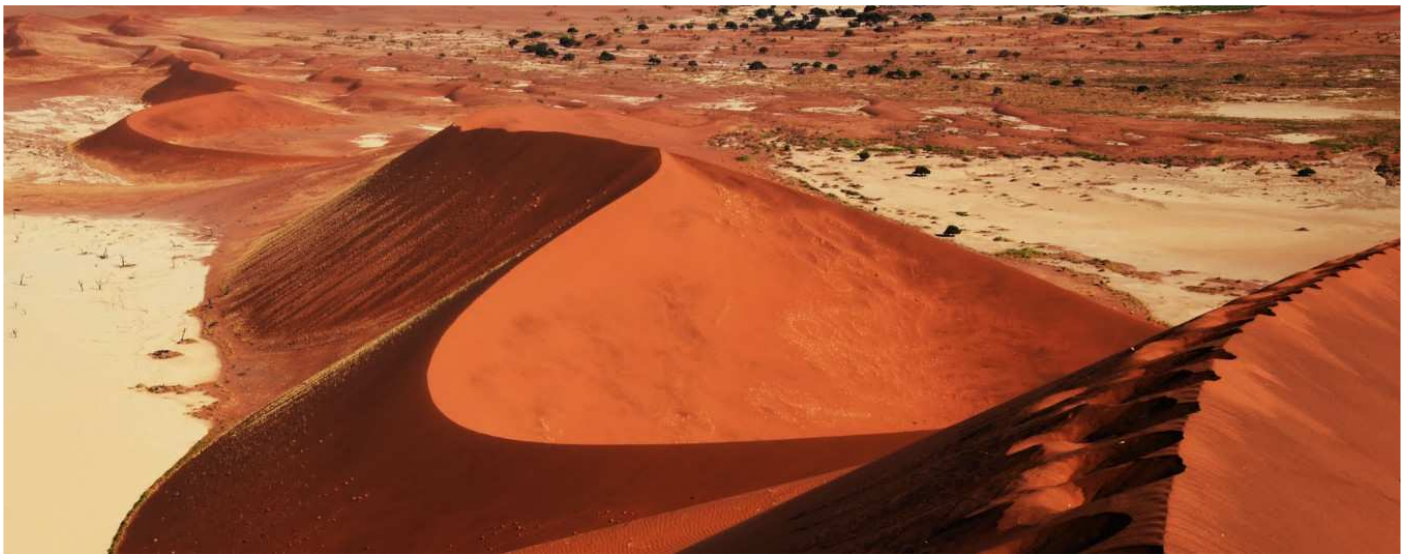
Sossusvlei, Namibia (part of our trip)