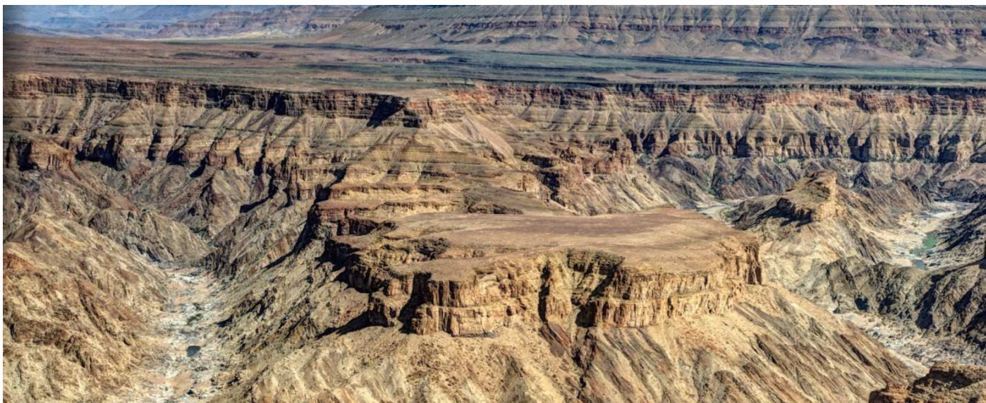
Fish River Canyon, Namibia, Southern Africa (part of our trip)