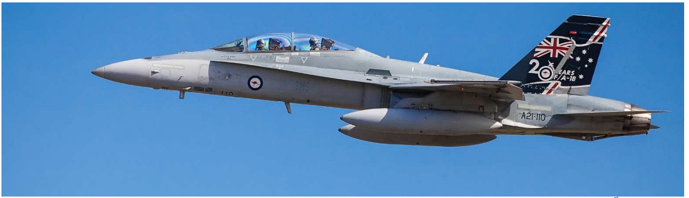
Flypast of F18 at 'Wings over the Illawarra' Air Show 4 th May, 2014