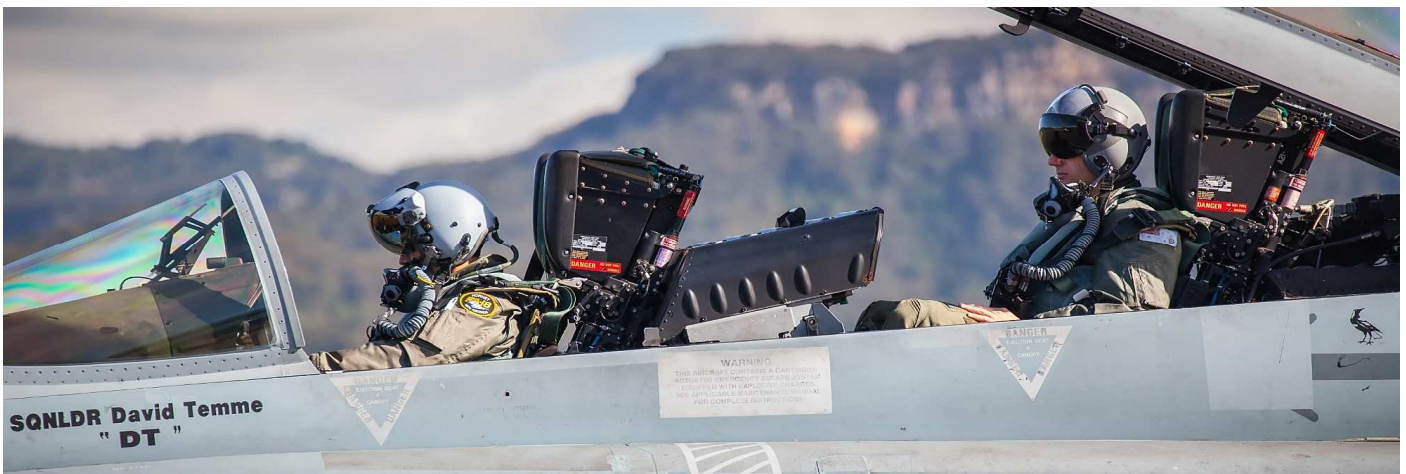
F18 pilots at 'Wings over the Illawarra' Air Show 4 th May, 2014

Images from above Tasks & Outings can be put in Greg's letterbox (7 Eisenhower Place, Bonnet Bay) till Sunday 29 th June.