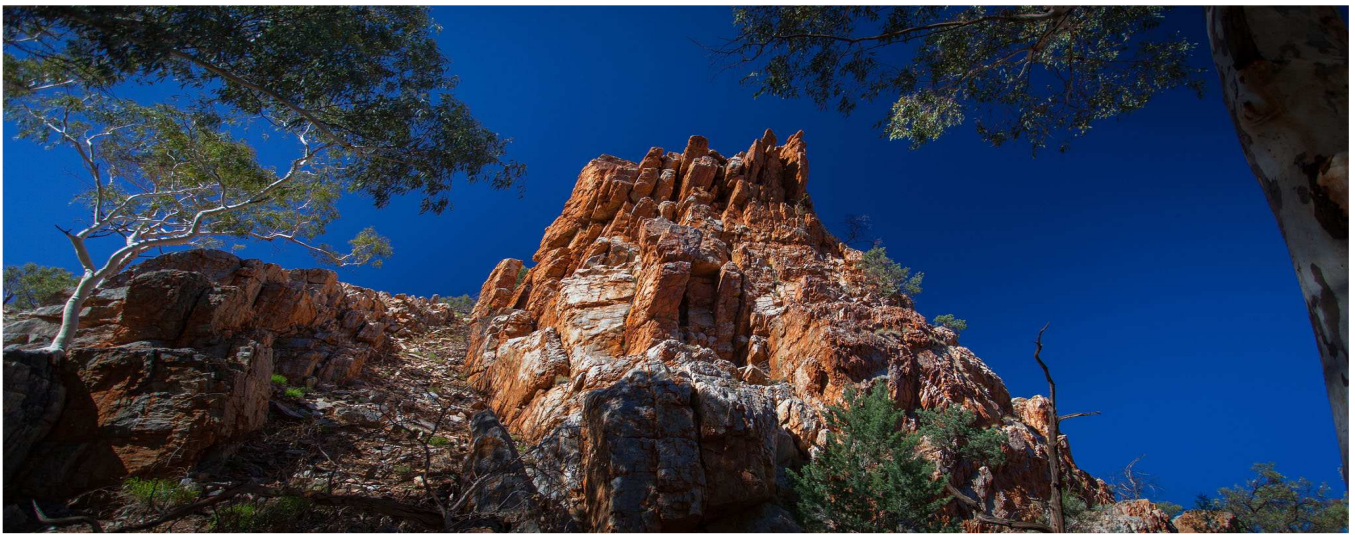
View walking through gorge to Stanley Chasm (Western MacDonnell Ranges)